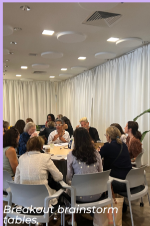
Breakout brainstorm tables.