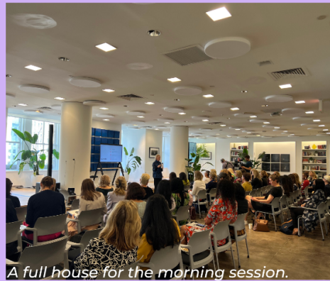
A full house for the morning session.